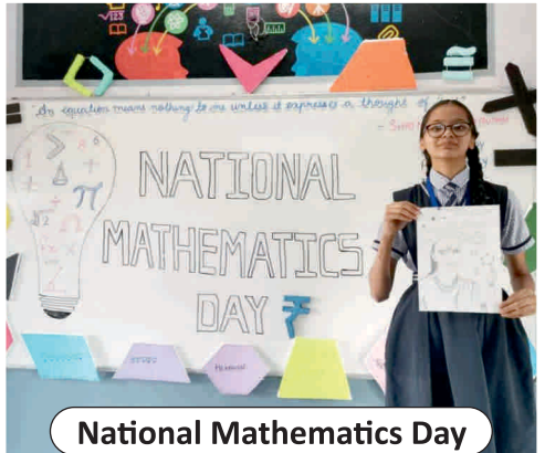
National Mathematics Day