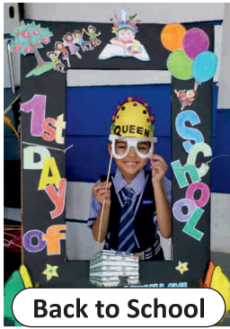
Back to School