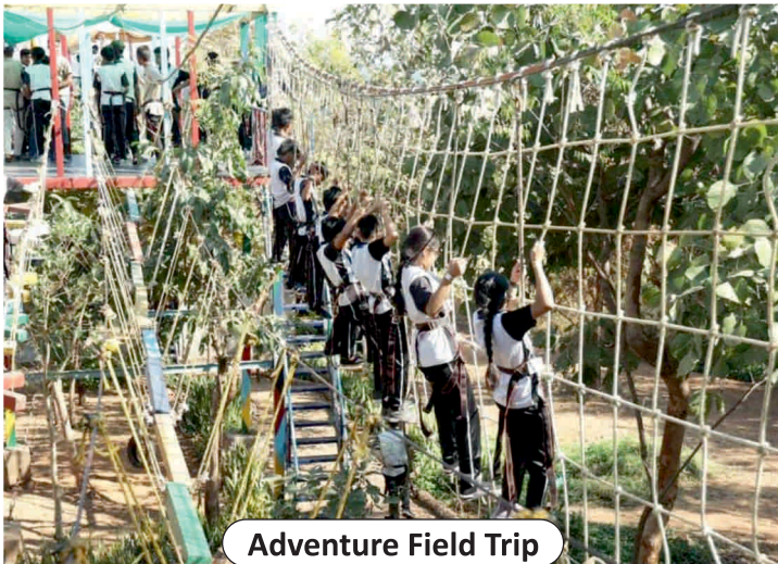
Adventure Field Trip