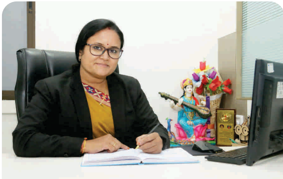
Principal - English Medium (98249 44457)

It is with great pride I welcome you to Sunrise Group Of Schools. In selecting our school for your child you have chosen a caring, community school with a friendly, happy and dynamic learning environment, where all students work to achieve their best. Our philosophy demonstrates the belief that the education of our children is a joint effort between home and school.