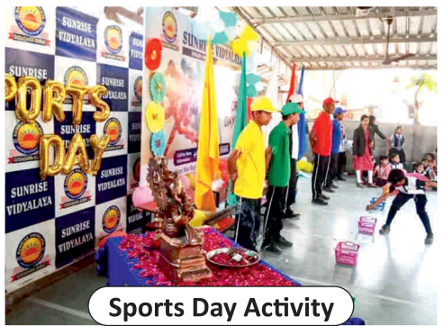
Sports Day Activity