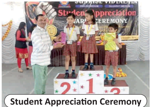
Student Appreciation Ceremony