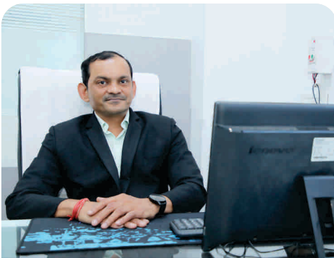
Co-ordinator-Gujarati Medium (99254 95953)

Welcome to Sunrise School! When learning and teaching continually improves, everything improves." Education lays the foundation stone for our future. We all know that learning is a lifelong process so, getting a good education is imperative in today's society as it is a foundation of our successful future. Our vision is to develop inquiring, knowledgeable and caring young minds. Sunrise School strives to prepare students to understand, contribute & succeed in a rapidly changing society, thus making a better people, for a better world.